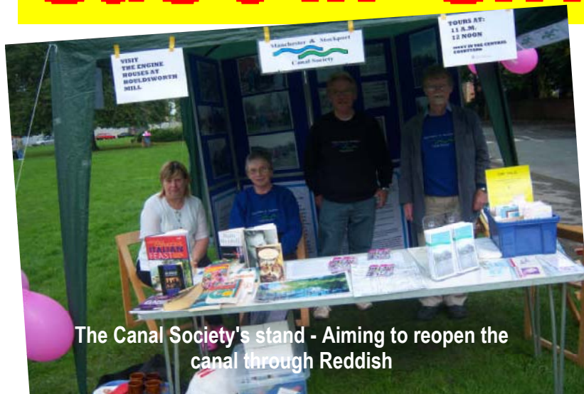
The Canal Society's stand - Aiming to reopen the canal through Reddish