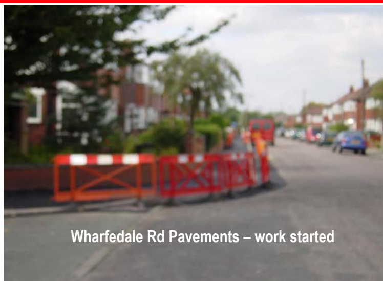
Wharfedale Rd Pavements – work started