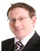
Andrew Gwynne MP 320 1504