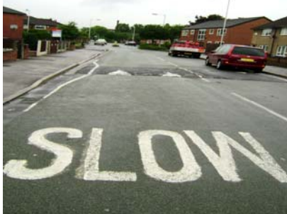
Harrogate Rd - part of the scheme.

Proposals have been sent to local residents for their views. Please respond if you haven't done so already. We hope that people will support it to make the roads safe for everyone.