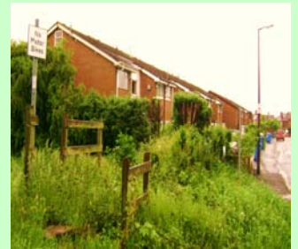
The entrance to the site works and the school on Mill Lane

If you want to know more get in touch with us on 292 5693 or 432 2188.